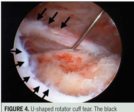
FIGURE 4. U-shaped rotator cuff tear. The black arrows demonstrate the periphery of the tear; the greater tuberosity has been prepared for cuff repair.

insertion. Through these portals, various instruments can be introduced into the shoulder to mobilize the cuff, implant suture anchors, and tie arthroscopic knots to hold the torn tendon to bone.